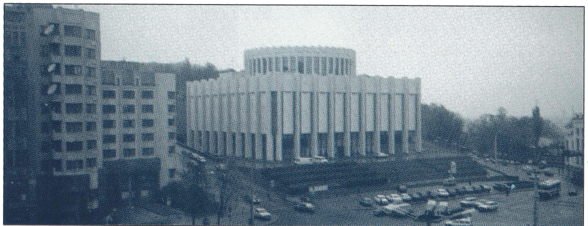
CUP Office located in Ukrainsky Dim in downtown Kyiv.